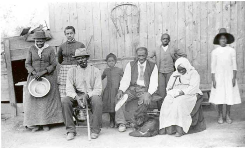
Harriet Tubman with family and friends, standing by the side of her barn in Auburn, New York, circa 1887.

After the war, Tubman returned to Auburn, New York. Tubman helped settle her parents and other family and friends in the community. In Auburn, she began another career as a community activist, humanitarian, and suffragist. Her humanitarian work triumphed with the opening of the Harriet Tubman Home for the Aged, located on land abutting her own property in Auburn, which she successfully purchased by mortgage and then transferred to the African Methodist Episcopal Zion Church in 1903. Active in the suffrage movement since 1860, Tubman continued to appear at local and national suffrage conventions until the early 1900s.