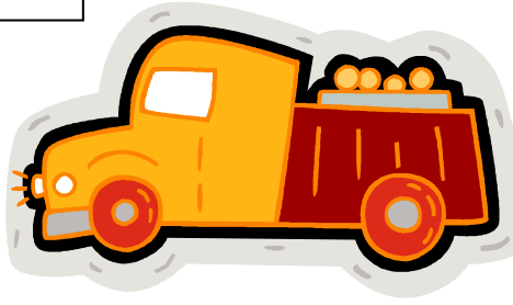
Oranges are trucked.