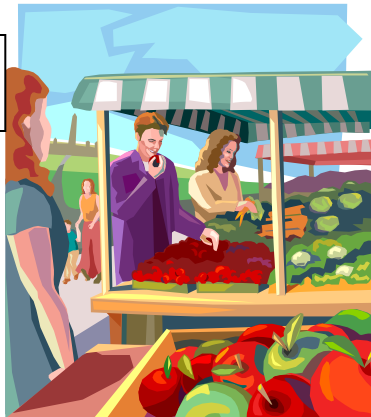
Oranges are sold.