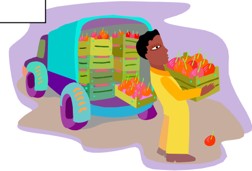
Oranges are loaded and hauled.