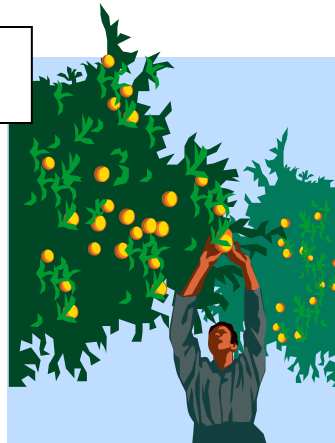
Oranges are picked.