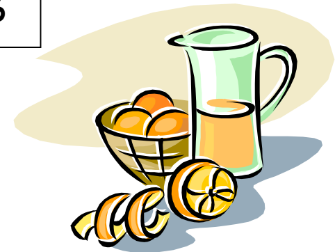
Oranges are for orange juice!