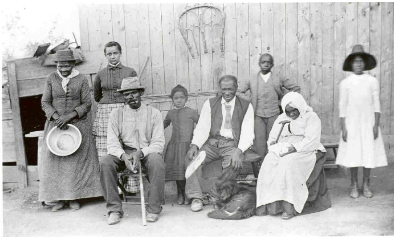
Harriet Tubman with family and friends, standing by the side of her barn in Auburn, New York, circa 1887.

After the war, Tubman returned to Auburn, New York. Tubman helped settle her parents and other family and friends in the community. In Auburn, she began another career as a community activist, humanitarian, and suffragist. Her humanitarian work triumphed with the opening of the Harriet Tubman Home for the Aged, located on land abutting her own property in Auburn, which she successfully purchased by mortgage and then transferred to the African Methodist Episcopal Zion Church in 1903. Active in the suffrage movement since 1860, Tubman continued to appear at local and national suffrage conventions until the early 1900s.